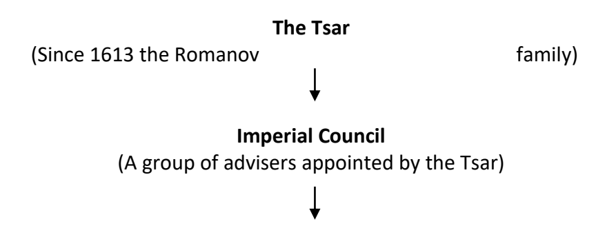
The Cabinet of Ministers (Appointed by the Tsar to run the government departments)