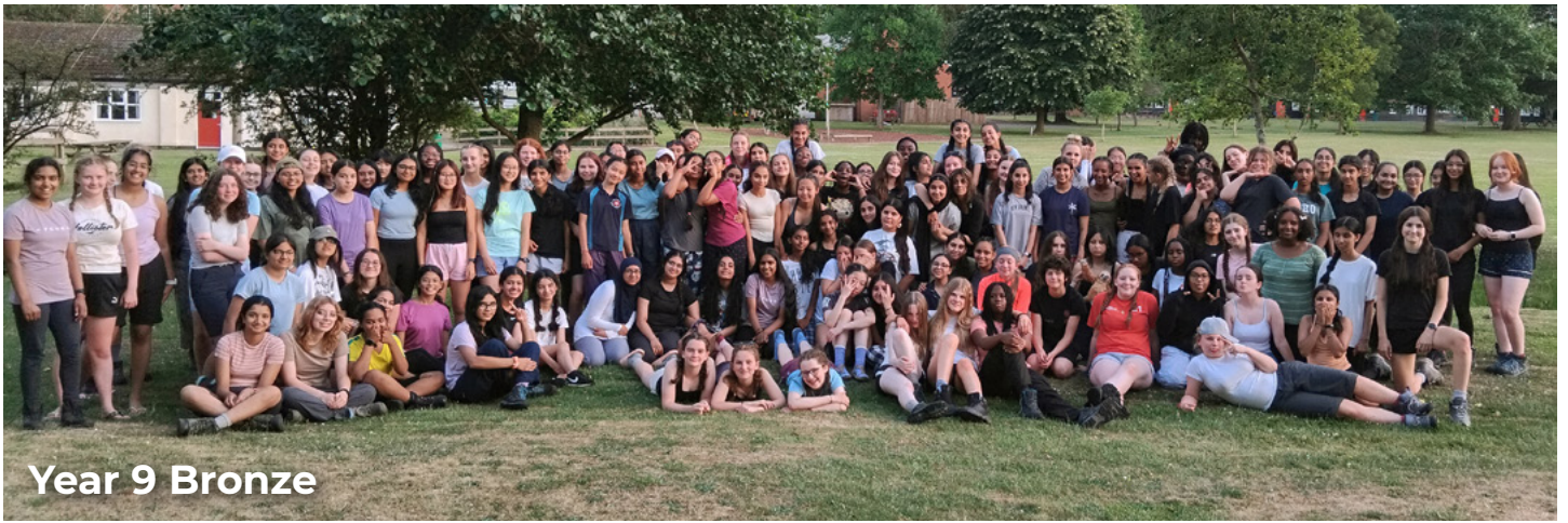
Year 9 Bronze