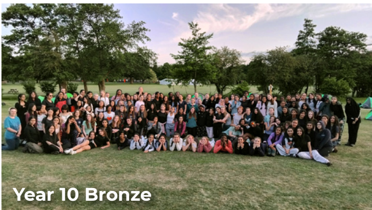
Year 10 Bronze