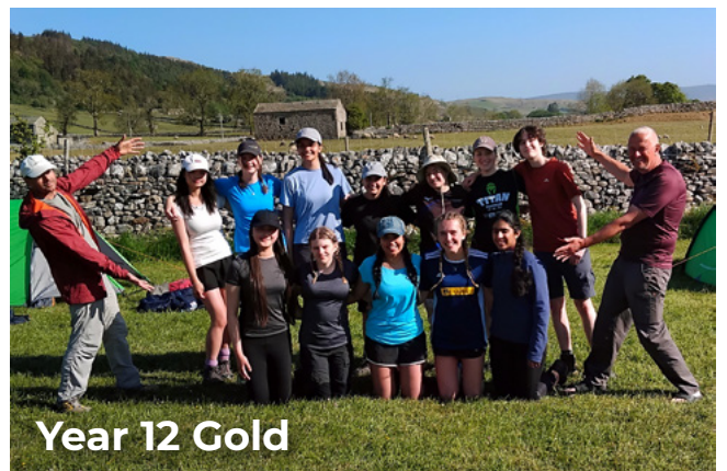
Year 12 Gold