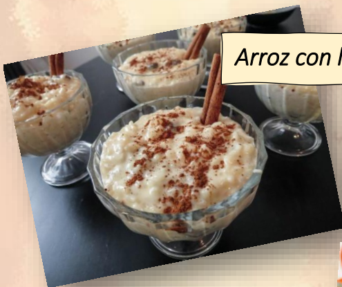
Arroz con leche