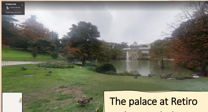
The palace at Retiro Park in Madrid