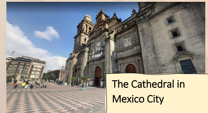
The Cathedral in Mexico City