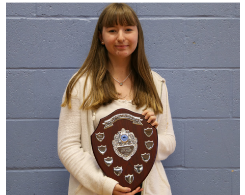
Freya - Delphinus